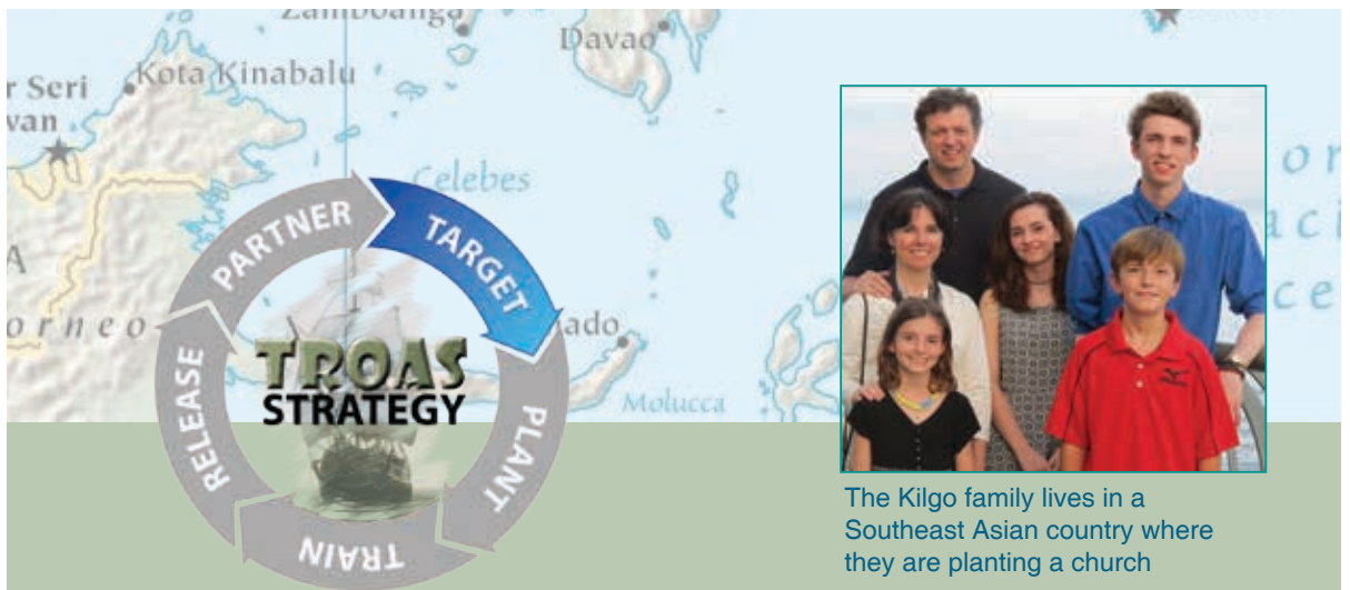
The Kilgo family lives in a Southeast Asian country where they are planting a church