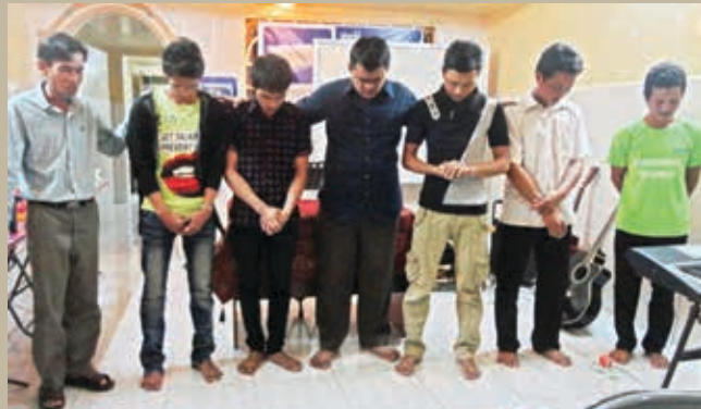
Students pray for salvation after message

TRUST in the Lord of Missions. The fundamentals are trusting in God's Word, His promises and power. Trust God to grow the gospel seed. Missions is God's work. What a privilege and all glory belongs to Him alone! ☼