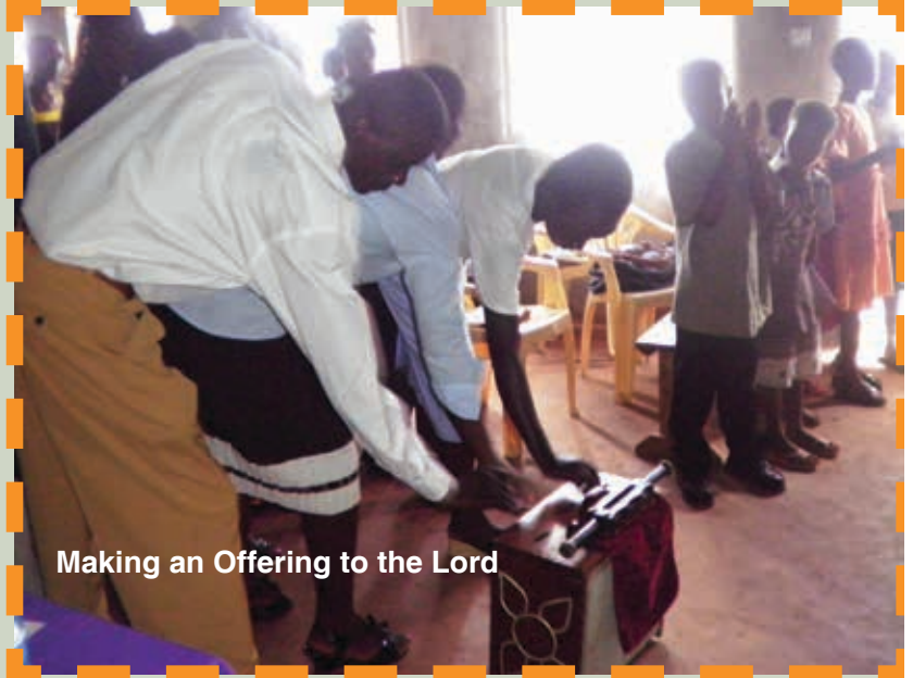
Making an Offering to the Lord

Better known as Local Church Impact along with Personal Evangelism. Every member is established in the unique teaching of core values for the message of grace, to enable him to show others about grace doctrine. Why attend Grace Bible Church when there are hundreds of denominations all over? Members are equipped with lessons comparing the teachings of various denominations,